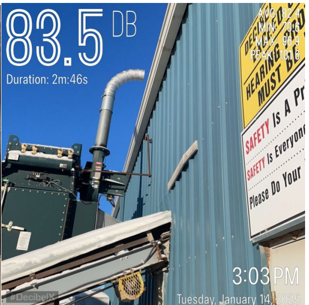
Outside by walkway with dust collector on