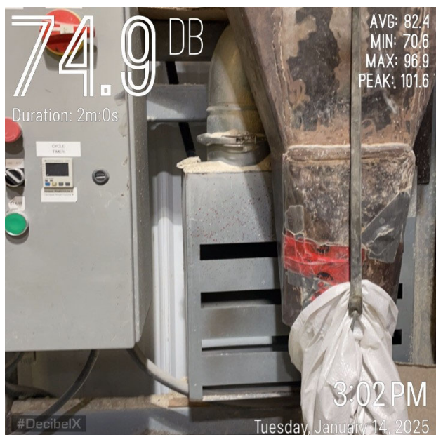
Inside the plant with dust collector on